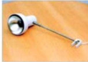
Spot Light (220 v - 75 w)