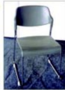
Metal Frame (Moulded Seat & Back)