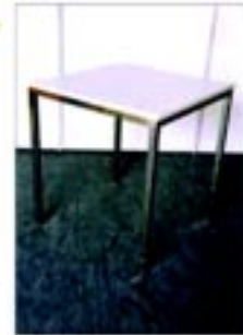
Square Table (750 × 750 × 750 mm)