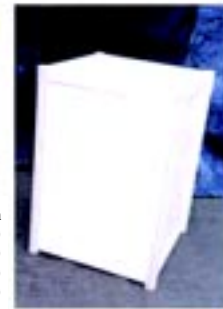
Podium (500 × 500 × 750 mm) (500 × 500 × 900 mm) (1000 × 500 × 750 mm) (1000 × 1000 × 750 mm)