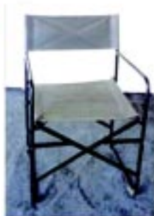
Oldie (Folding Chair)