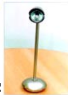
Spot Light (12 v - 50 w)