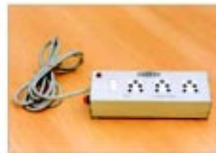
Strip Socket Max. 1 kw.