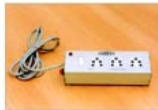
Strip Socket Max. 1 kw.