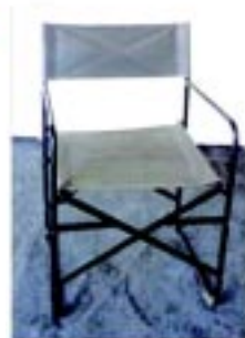
Oldie (Folding Chair)