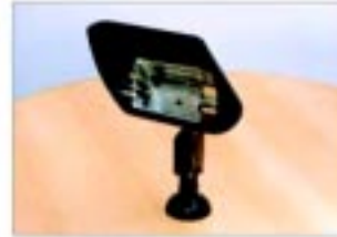
Halogen Light (220 v - 300/500 w)