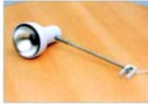
Spot Light (220 v - 75 w)