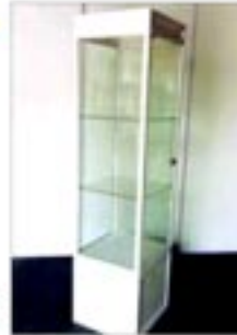
Show Case (500 × 500 × 2000 mm)