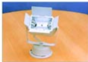
Halogen Light (220 v - 150/300w)