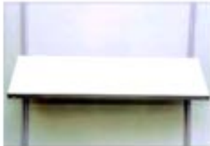
Magazine Shelf (Flat/Sloping) (1100 × 300 mm)