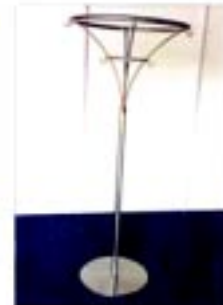
Coat Stand (Metal Frame)