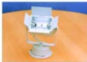
Halogen Light (220 v - 150/300w)