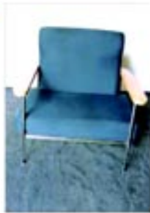
Sofa (Single Seater)