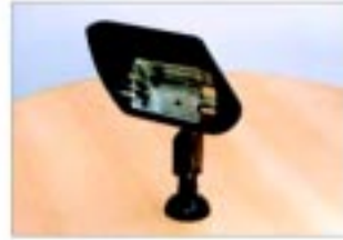
Halogen Light (220 v - 300/500 w)