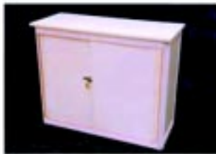
Side Rack (945 × 400 × 750 mm)