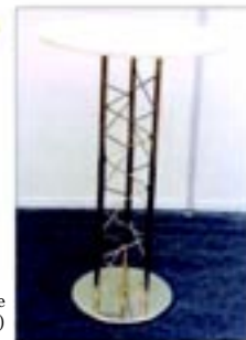
Tall Round Table (6000 × 1100 mm)