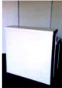
Information Counter (1010 × 520 × 1000 mm)