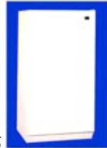
Fridge 100 L (900 × 450 × 450 mm)