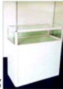
Glass Counter (1000 × 500 × 1000 mm)