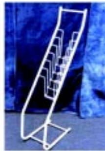
Magazine Stand (Metal Frame)