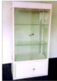
Show Case (1000 × 500 × 2000 mm)