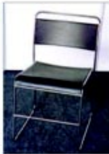
Metal Chair (Perforated Metal)