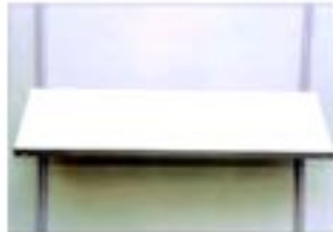
Magazine Shelf (Flat/Sloping) (1100 × 300 mm)