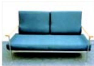
Sofa (Two Seater)