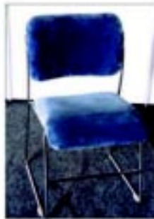
Novia Chair (Upholstered Seat & Back)