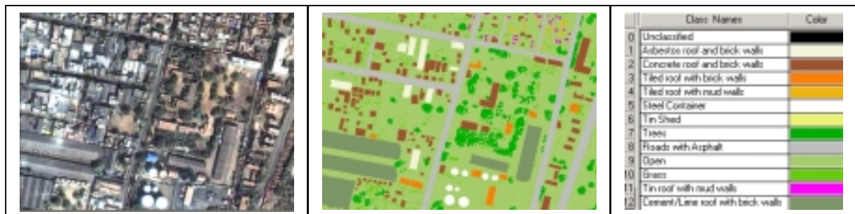
Figure below shows the different construction materials assessed using QuickBird image-

Since the objective of the study was to identify the different kind of construction materials, the study was not done for a specific area. However to get variety of construction material in single image, QuickBird image of Mecca city at 0.61m was primarily used to identify the various types of building and assess the building material. Mecca, being a historic, religious and developing city is a place with ancient mosques & houses to modern architectural buildings. QuickBird image of Chennai was used to map the construction materials.